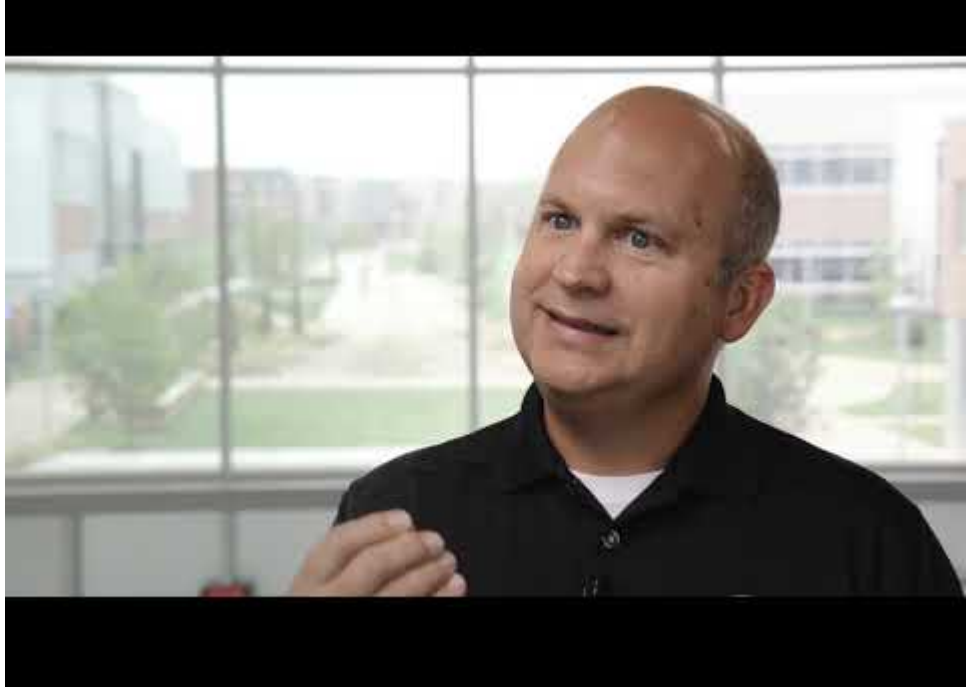
Wichita Aviation Talent Pipeline