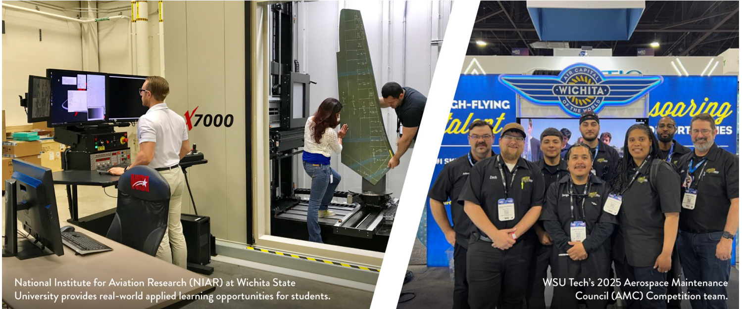
National Institute for Aviation Research (NIAR) at Wichita State University provides real-world applied learning opportunities for students.