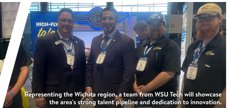
Representing the Wichita region, a team from WSU Tech will showcase the area's strong talent pipeline and dedication to innovation.