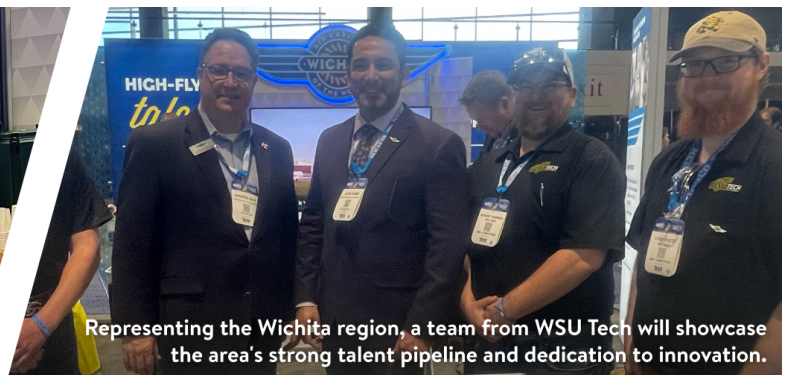
Representing the Wichita region, a team from WSU Tech will showcase the area's strong talent pipeline and dedication to innovation.