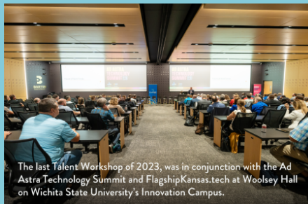
The last Talent Workshop of 2023, was in conjunction with the Ad Astra Technology Summit and Flagship.Kansas.tech at Woolsey Hall on Wichita State University's Innovation Campus.