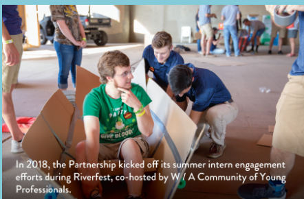
In 2018, the Partnership kicked off its summer intern engagement efforts during Riverfest, co-hosted by W / A Community of Young Professionals.