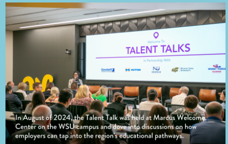
In August of 2024, the Talent Talk was held at Marcus Welcome Center on the WSU campus and dove into discussions on how employers can tap into the region's educational pathways.