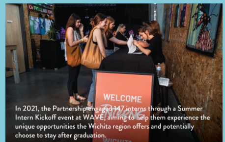
In 2021, the Partnership engaged 117 interns through a Summer Intern Kickoff event at WAVE, aiming to help them experience the unique opportunities the Wichita region offers and potentially choose to stay after graduation.