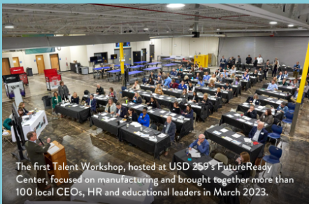
The first Talent Workshop, hosted at USD 259's FutureReady Center, focused on manufacturing and brought together more than 100 local CEOs, HR and educational leaders in March 2023.