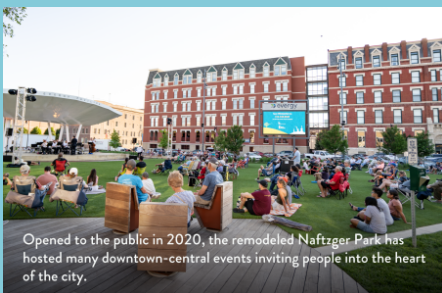
Opened to the public in 2020, the remodeled Naftzger Park has hosted many downtown-central events inviting people into the heart of the city.