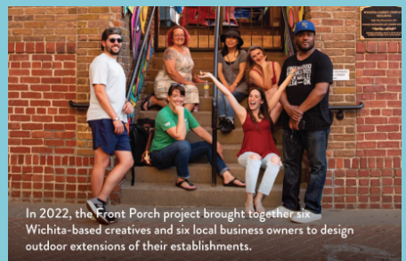
In 2022, the Front Porch project brought together six Wichita-based creatives and six local business owners to design outdoor extensions of their establishments.