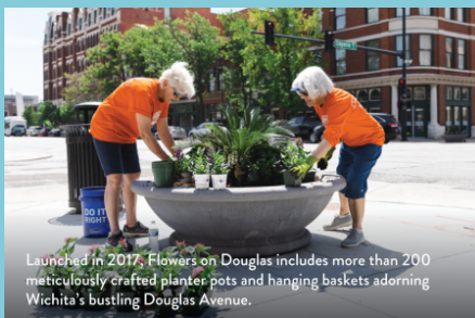
Launched in 2017, Flowers on Douglas includes more than 200 meticulously crafted planter pots and hanging baskets adorning Wichita's bustling Douglas Avenue.