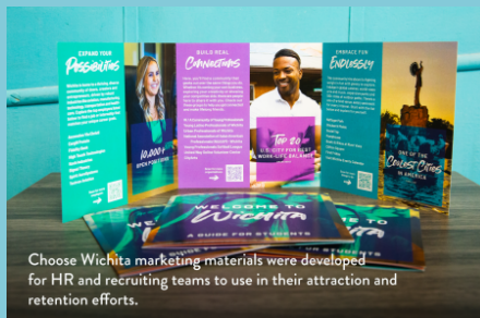
Choose Wichita marketing materials were developed for HR and recruiting teams to use in their attraction and retention efforts.