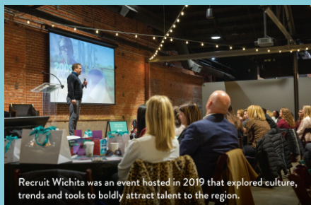
Recruit Wichita was an event hosted in 2019 that explored culture, trends and tools to boldly attract talent to the region.