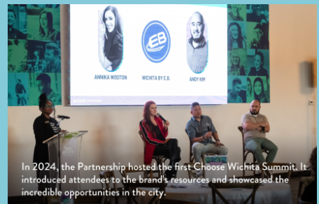
In 2024, the Partnership hosted the first Choose Wichita Summit. It introduced attendees to the brand's resources and showcased the incredible opportunities in the city.