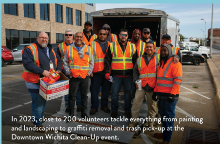
In 2023, close to 200 volunteers tackle everything from painting and landscaping to graffiti removal and trash pick-up at the Downtown Wichita Clean-Up event.