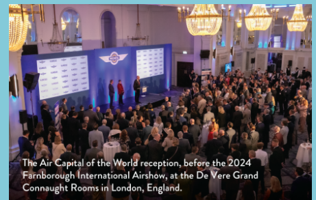
The Air Capital of the World reception, before the 2024 Farnborough International Airshow, at the De Vere Grand Connaught Rooms in London, England.