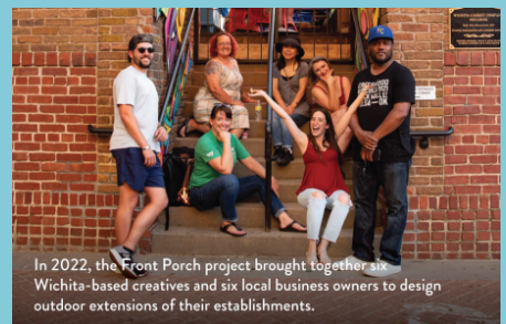
In 2022, the Front Porch project brought together six Wichita-based creatives and six local business owners to design outdoor extensions of their establishments.