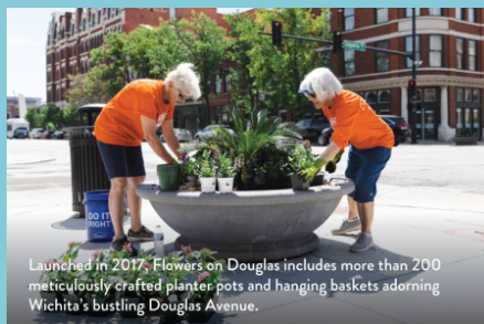
Launched in 2017, Flowers on Douglas includes more than 200 meticulously crafted planter pots and hanging baskets adorning Wichita's bustling Douglas Avenue.