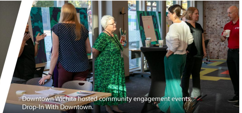
Downtown Wichita hosted community engagement events, Drop-In With Downtown.