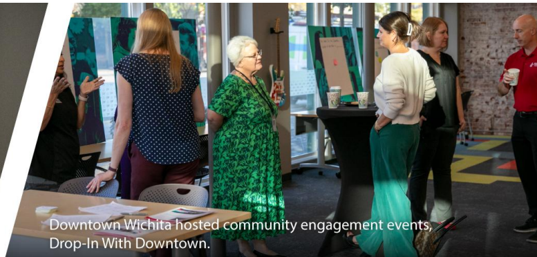
Downtown Wichita hosted community engagement events, Drop-In With Downtown.