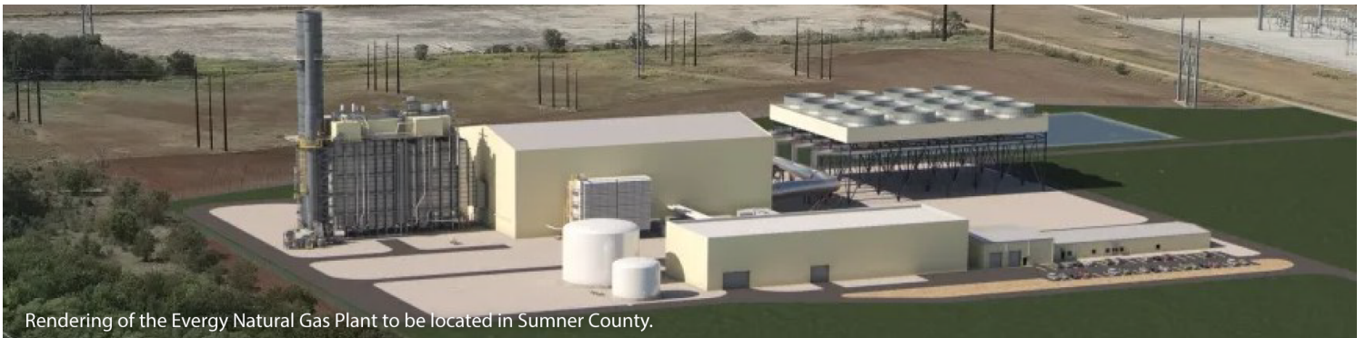
Rendering of the Evergy Natural Gas Plant to be located in Sumner County.

Located in Reno and Sumner counties, each plant is expected to create more than 500 construction jobs and 20-40 full-time, skilled-craft positions once operational. After a 10-year tax exemption, the plants are projected to generate more than $500 million in property tax revenue.