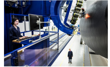
10 Keys to Greater Wichita Success

jQuery(document).ready(function() { console.log('1'); jQuery(".image-260x150").find(".centered-column").addClass("uk-width-1-2").addClass("uk-width-1-4@s").removeClass("uk-width-1-2@s"); });