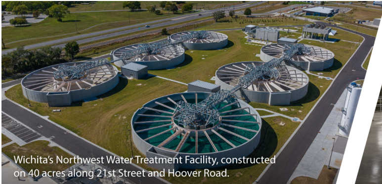
Wichita's Northwest Water Treatment Facility, constructed on 40 acres along 21st Street and Hoover Road.

The Wichita region is making significant strides to strengthen its infrastructure with several major projects, including the City of Wichita's Northwest Water Treatment Facility, Evergy's investment in two new natural gas plants and the Kansas Department of Transportation's North Junction. In conjunction with numerous other infrastructure investments, these large-scale projects represent commitments to the region's long-term growth, sustainability and economic vitality.