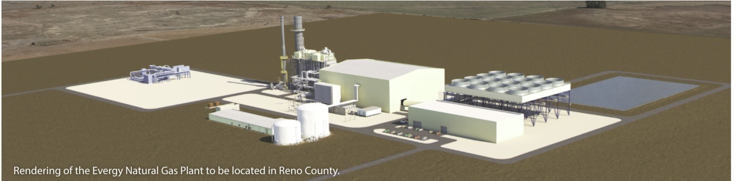
Rendering of the Evergy Natural Gas Plant to be located in Reno County.