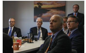
Novacoast Announces New Headquarters in Wichita, Kansas