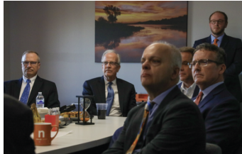
Novacoast Announces New Headquarters in Wichita, Kansas