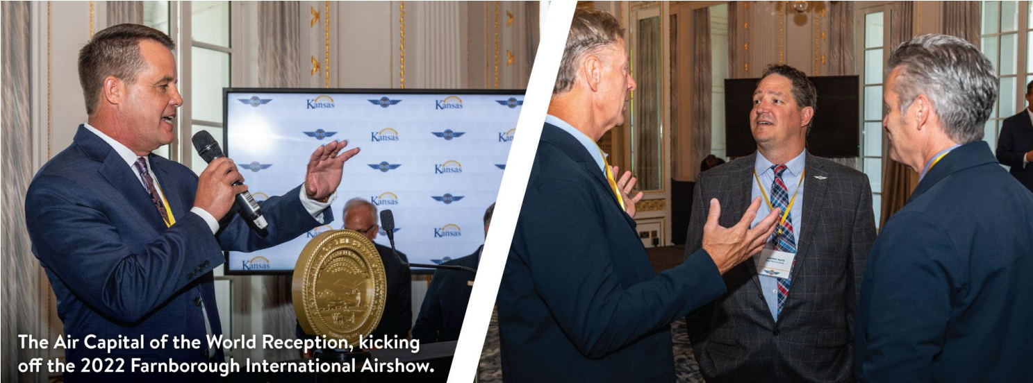
The Air Capital of the World Reception, kicking off the 2022 Farnborough International Airshow.