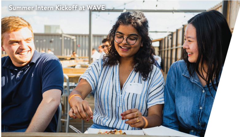
Intern webpage and texting platform