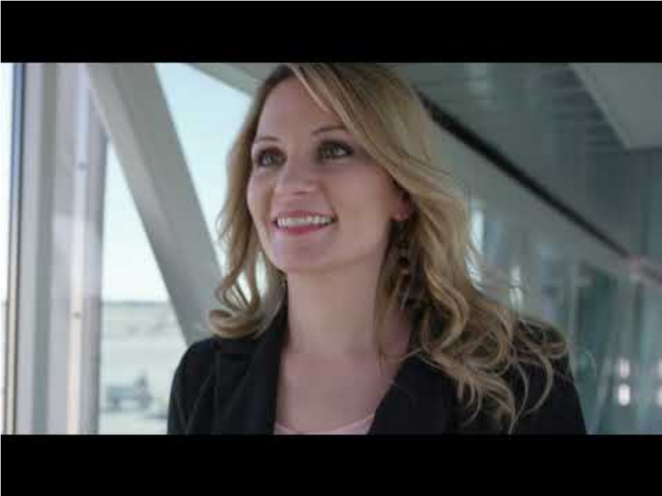
Businesses Thrive Here – The Greater Wichita Region