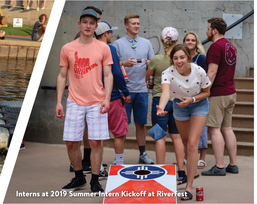
Interns at 2019 Summer Intern Kickoff at Riverfest

Our summer intern engagement efforts started in 2018 with a kickoff event during Riverfest co-hosted by W / A Community of Young Professionals . We adjust our strategies each year based on feedback from interns and local HR professionals to continually enhance the intern experience. In the case of 2020 and 2021, we adapted to ensure interns could experience Wichita and interact with one another safely. This year, we carried out three initiatives to engage interns with the Wichita region.