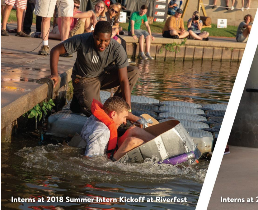
Interns at 2018 Summer Intern Kickoff at Riverfest