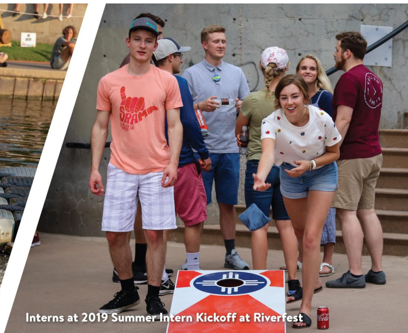
Interns at 2019 Summer Intern Kickoff at Riverfest

Our summer intern engagement efforts started in 2018 with a kickoff event during Riverfest co-hosted by W / A Community of Young Professionals . We adjust our strategies each year based on feedback from interns and local HR professionals to continually enhance the intern experience. In the case of 2020 and 2021, we adapted to ensure interns could experience Wichita and interact with one another safely. This year, we carried out three initiatives to engage interns with the Wichita region.