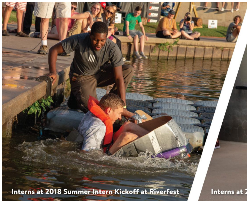
Interns at 2018 Summer Intern Kickoff at Riverfest