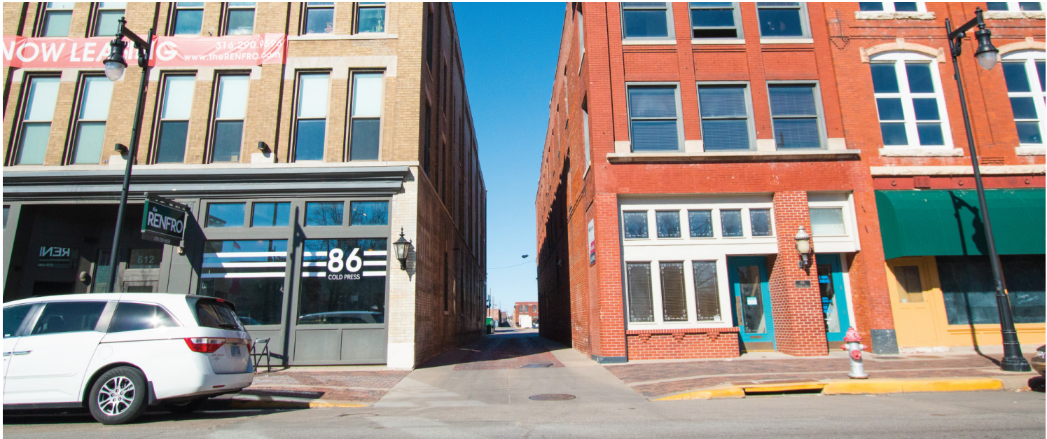
Gallery Alley before activation

The 2017 pilot project closed the alley to vehicular traffic, added overhead lighting, public art and seating options. The pilot proved to be an instant success as the residents and surrounding businesses quickly began regularly using the space to gather, experience art, have a coffee and meet with friends.