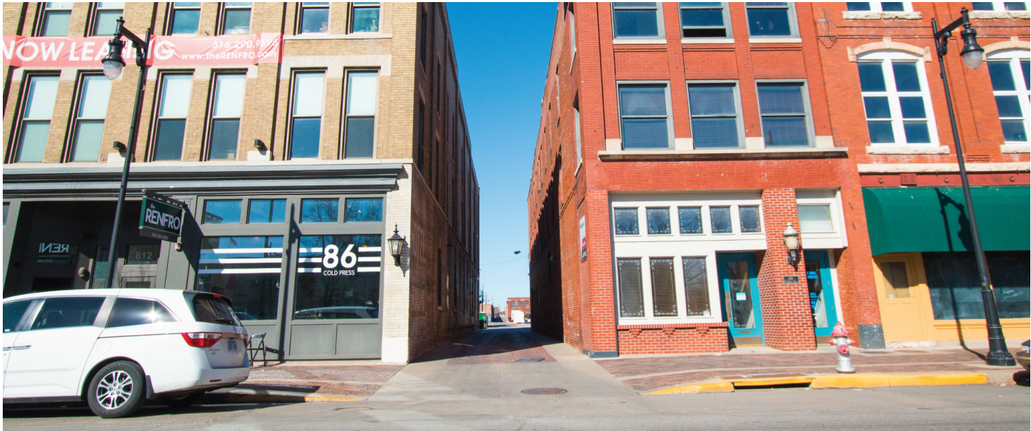
Gallery Alley before activation

The 2017 pilot project closed the alley to vehicular traffic, added overhead lighting, public art and seating options. The pilot proved to be an instant success as the residents and surrounding businesses quickly began regularly using the space to gather, experience art, have a coffee and meet with friends.