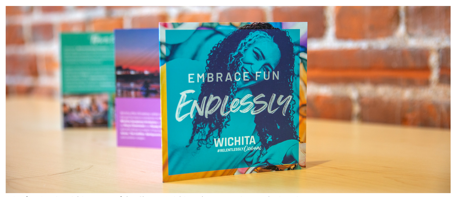
A Perfect Day in Wichita – one of the Choose Wichita talent attraction marketing pieces.

The Greater Wichita Partnership is ready to assist you in providing the resources needed to attract and develop talent in the region.