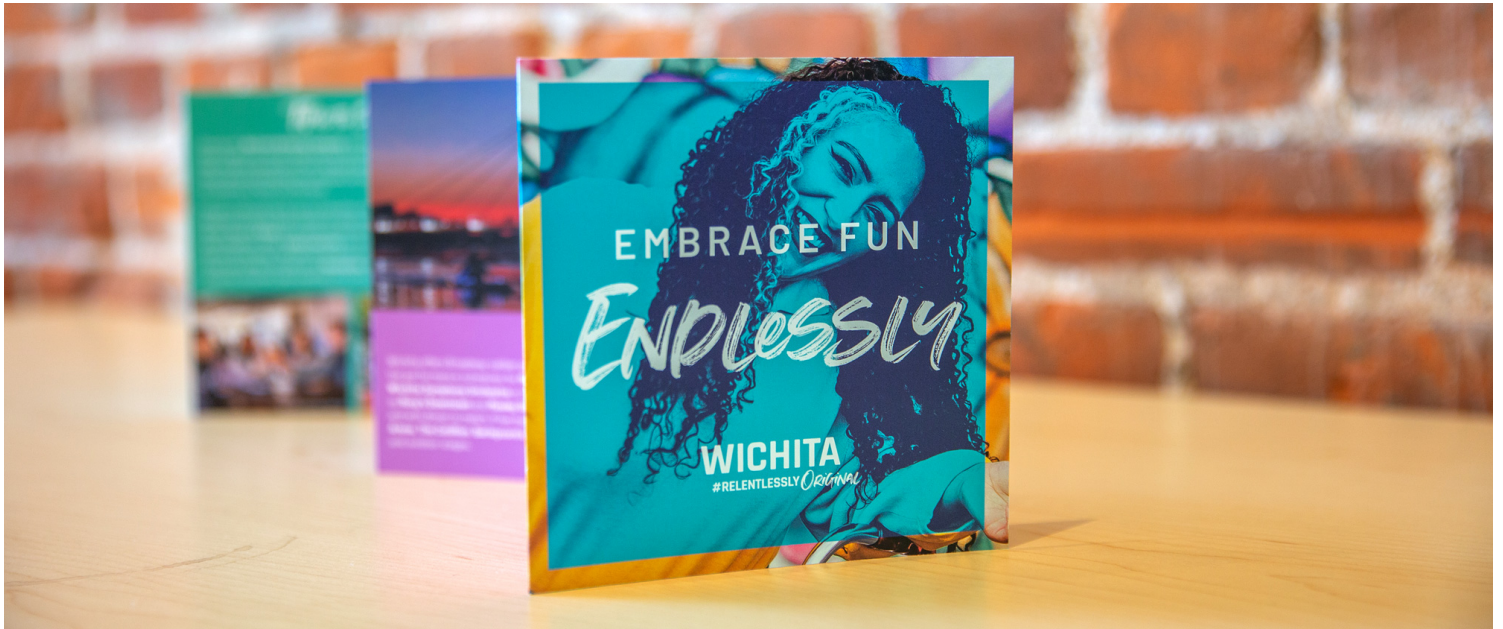
A Perfect Day in Wichita – one of the Choose Wichita talent attraction marketing pieces.

The Greater Wichita Partnership is ready to assist you in providing the resources needed to attract and develop talent in the region.