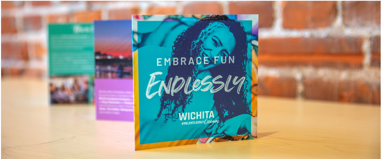
A Perfect Day in Wichita – one of the Choose Wichita talent attraction marketing pieces.

The Greater Wichita Partnership is ready to assist you in providing the resources needed to attract and develop talent in the region.