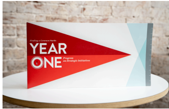
2016 Partnership Annual Report