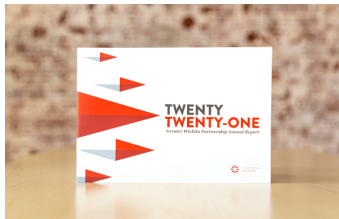
2021 Partnership Annual Report